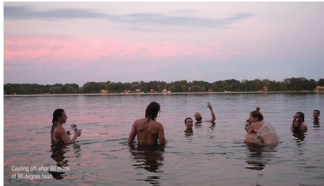
Cooling off after 60 miles of 90 degree heat.