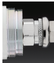
Figure 1 Track Cog & Lockring Threads

This means that both sides of the hub are designed for fixed-gear cycling. Both sides are stepped, with two different threading patterns. The inside threads (1.37" x 24 tpi) require a track cog. The outside threads are reverse threaded (1.29" x 24 tpi) and require a reverse threaded lockring. See Figure 1.